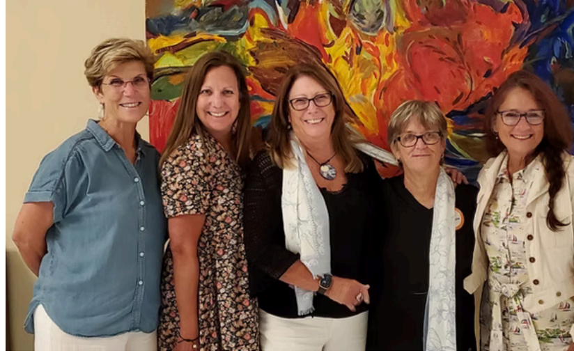
The women behind Talkable Communities — five CEOs who turned a shared question into a lifesaving mission.

Talkable Communities was born from a conversation that refused to stay small.